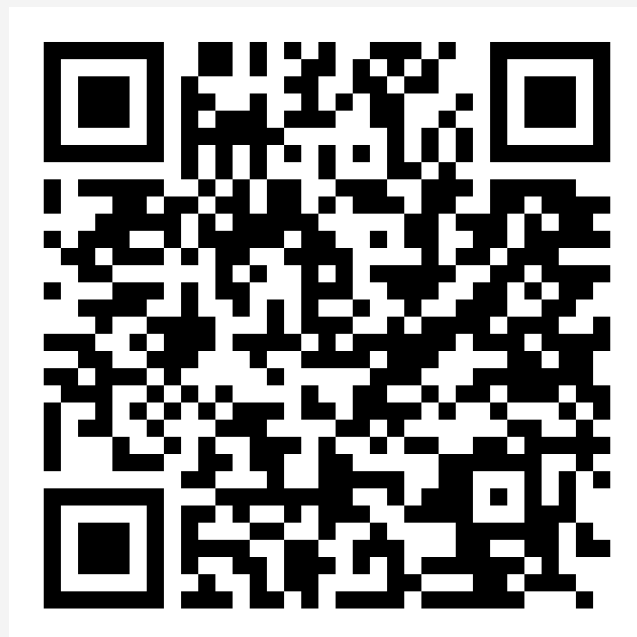
Scan for YU Interactive Map